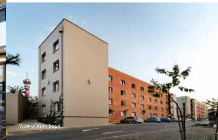
View of Kum Saan