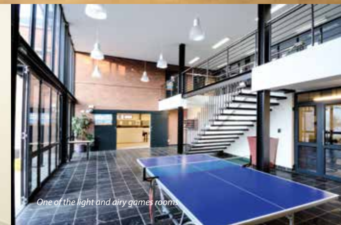
One of the light and airy games rooms