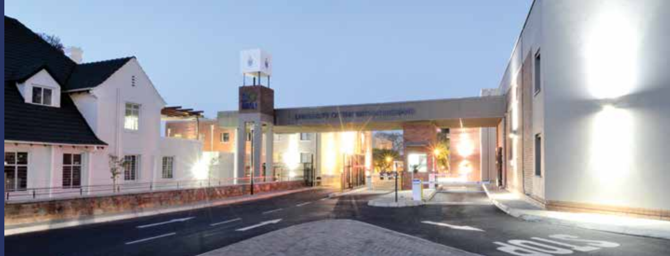
View of the main entrance to the residence complex