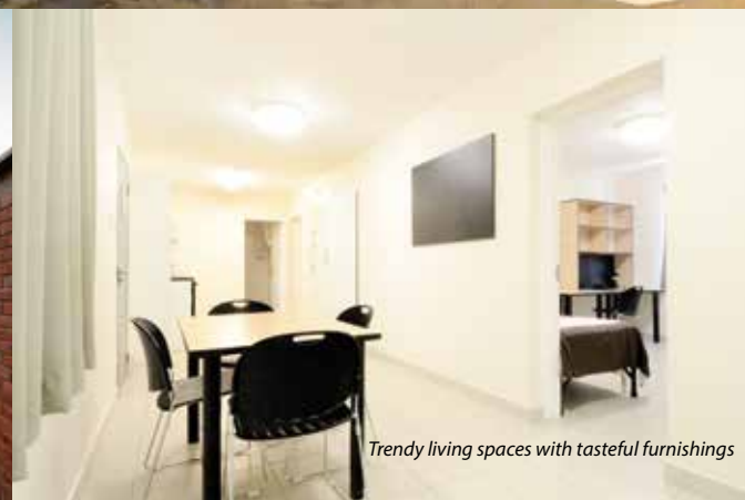
Trendy living spaces with tasteful furnishings