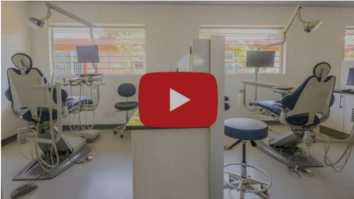
WATCH | New Wits dental clinic in Soweto ‘a long time in the making’